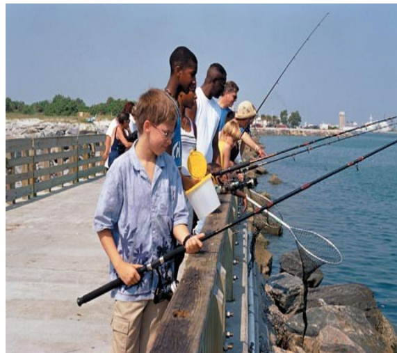
Jetty Park Fishing Pier